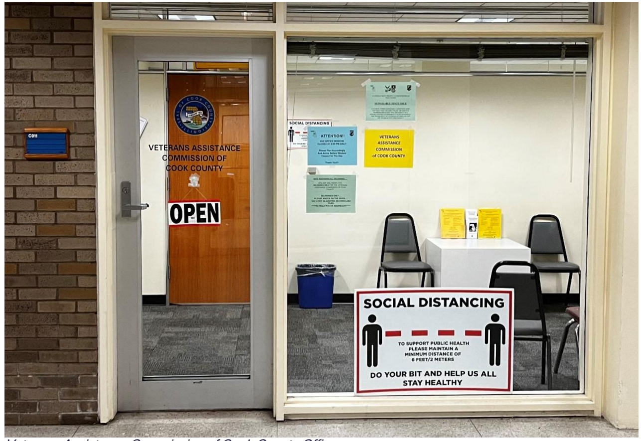
Veterans Assistance Commission of Cook County Office

The Veterans Assistance Commission of Cook County office is located within the Cook County Temporary Juvenile Detention Center Building (1100 S. Hamilton Ave. C-011 Lower Level, Chicago, II. 60612).