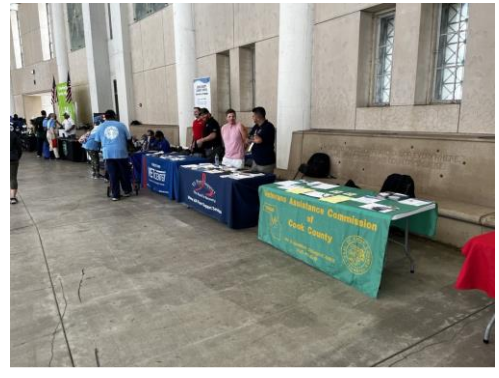
The Annual Veteran Valor Games and Resource Fair at Soldier Field