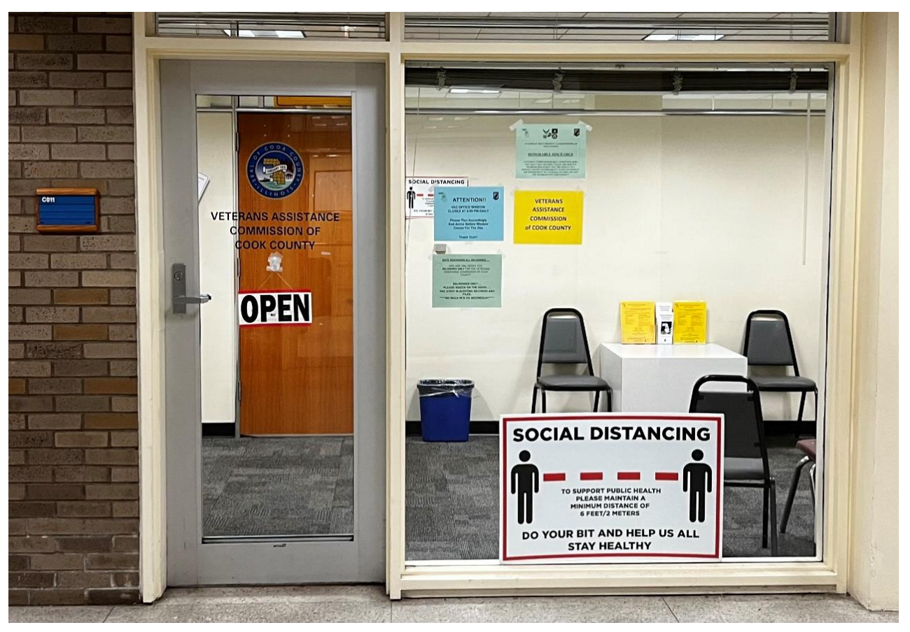
Veterans Assistance Commission of Cook County Office – 1100 S. Hamilton Ave. Chicago, IL. 60612

The Veterans Assistance Commission of Cook County office is located in the lower level of the Cook County Temporary Juvenile Detention Center Building.