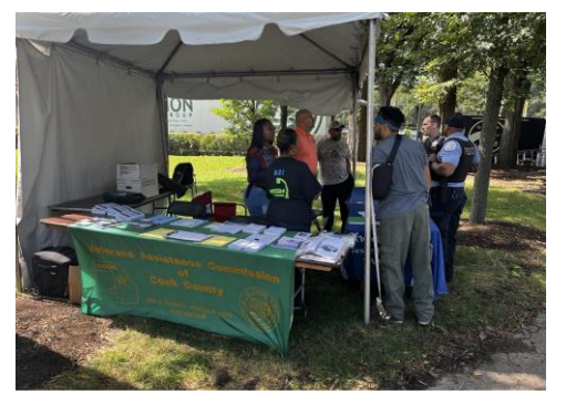
The VACCC attended the Taste of Chicago with Cognosante and the JBVA