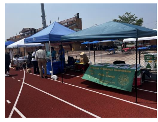
The Combined Veterans of Berwyn's Annual Veteran Event