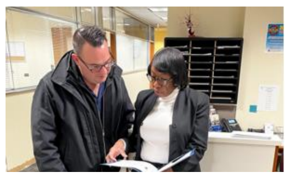
Senator Mike Porfirio toured the VACCC office to learn about VACCC benefits