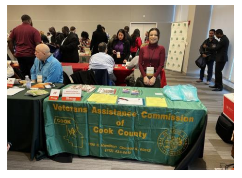
The City of Chicago's Annual Department of Procurement Symposium