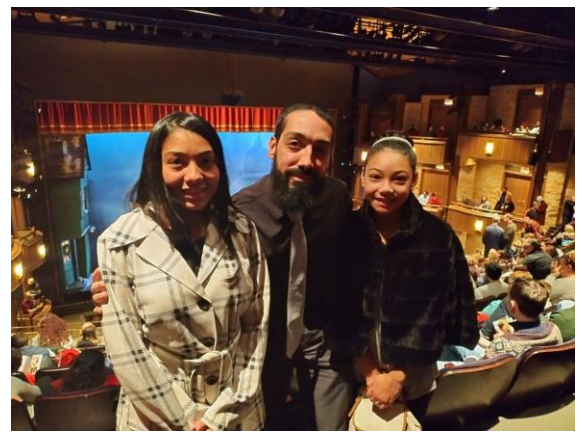
Cook County Veterans and their families were provided with free tickets to see "A Christmas Carol at the Goodman Theatre