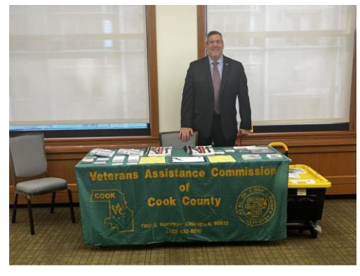
The Pritzker Military Museum & Library Veteran Resource Fair