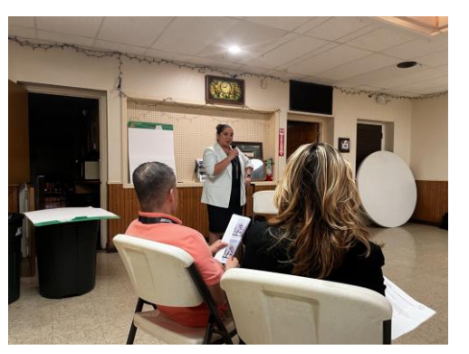
The VACCC Co-hosted with VFW Post 8322 Congresswoman Ramirez's Veteran Town Hall