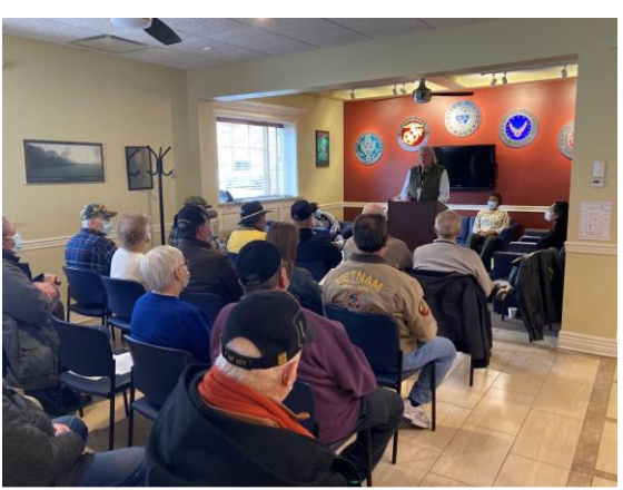
The VACCC Honored our Cook County Vietnam Veterans with the Forest Park Vet Center