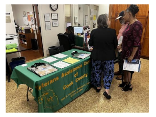
The Oak Park/Rover Forest Townships Senior Services Center