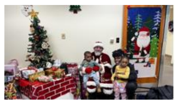
Cook County Veterans and their families' received gifts for the Holiday