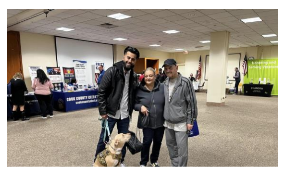
The VACCC hosted the 1st ever Veteran Resource Fair at the JTDC building